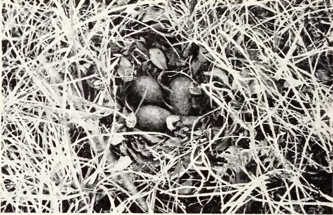
Fig. 4. Nest of Baird's Sandpiper, 22 June 1960.

repeatedly seen feeding in this territory. The Baird's Sandpiper, a secretive and shy bird, seemed to tolerate the plover's presence. On 18 July only one infertile egg was left in the nest. This is the first breeding record of the species for St. Lawrence Island.